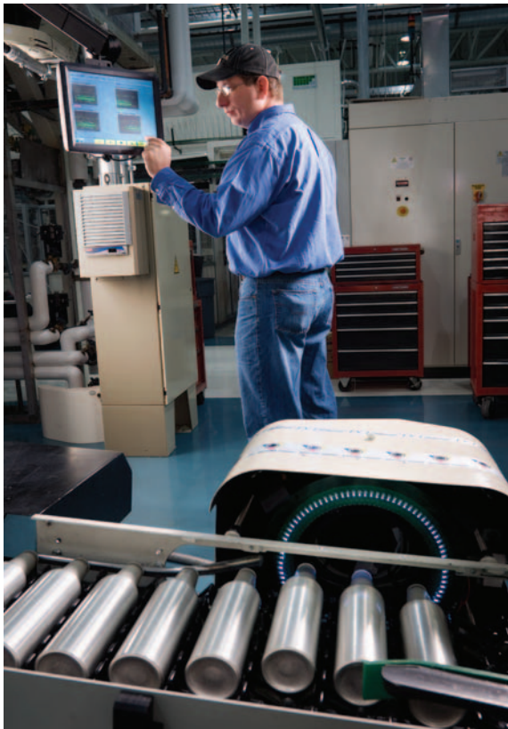
Your vision supplier must understand your manufacturing processes in order to develop the appropriate lighting and optics, software, and user interface for your application

When evaluating a supplier's hardware options, make sure they use off-the-shelf electronic hardware wherever possible to ease any needed repairs and take advantage of economies of scale. At the same time, the supplier should be able to design and implement specific hardware solutions if nothing is commercially available to meet your needs. For example, your vision supplier may need to design specific hardware to track parts at high speeds as this may not be readily available in the market place.